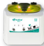
TrueBond Set 3