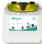
TrueBond Set 3