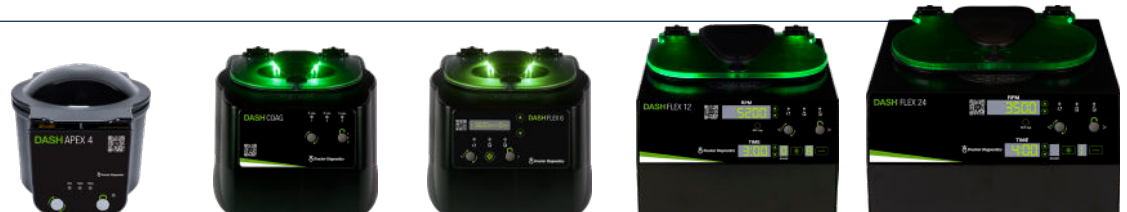
DASH Apex 4

Built to spin STAT, DASH centrifuges deliver quick spins when it matters most.