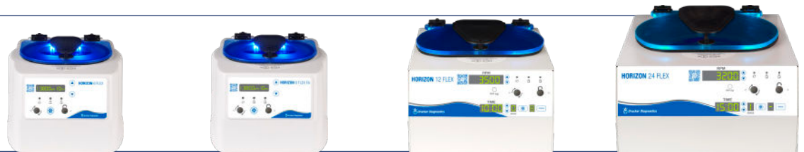
HORIZON 6 Flex*

Quality and value for routine chemistry.