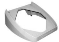
SmartView™ Platform p/n 00-079-009-001