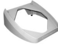
SmartView™ Platform p/n 00-079-009-001