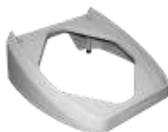
SmartView™ Platform p/n 00-079-009-001