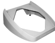
SmartView™ Platform p/n 00-079-009-001