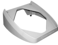
SmartView™ Platform p/n 00-079-009-001