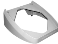
SmartView™ Platform p/n 00-079-009-001