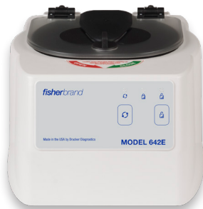
642E World's #1 clinical lab centrifuge For blood