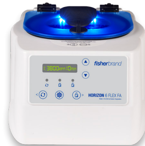
HORIZON 6 Flex FA Digital display, 10 cycles, 6 tube capacity For blood and urine