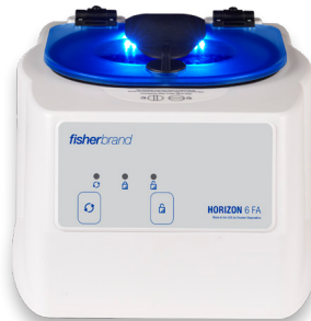
HORIZON 6 FA 3 preset cycles, 6 tube capacity For blood and urine