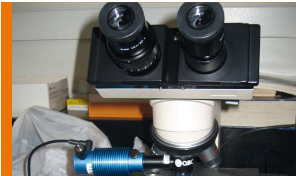
Figure 1. The ParaLens LED attachment on a traditional light microscope.

Problems arise, though, when these techniques are implemented in resource-limited settings. The high cost of traditional fluorescence microscopes (upwards of 30,000 USD per microscope) and peripherals, as well as the dangers of UV light and mercury vapour-based lamps have prohibited many countries from introducing these techniques.