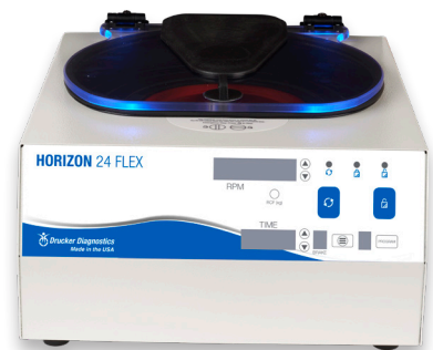
Horizon 24 FLEX