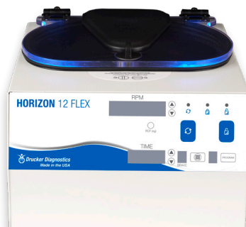
Horizon 12 FLEX