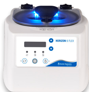
Horizon 6 FLEX

Designed, built, and supported in the USA