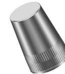
Shield caps p/n 7713011